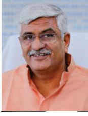
गजेंद्र सिंह शेखावत Gajendra Singh Shekhawat