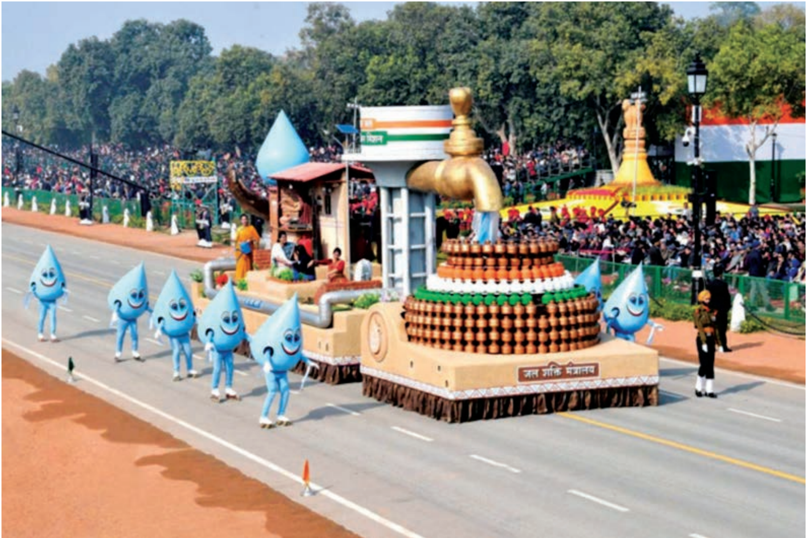
Best Tableaux, Republic Day Parade, 2020, on Jal Jeevan Mission